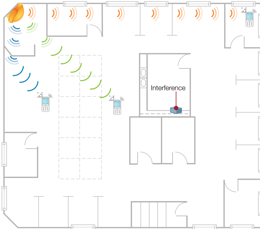
Figure 2: Better signal strength received at clients

Smart Wi-Fi provides dynamic path selection per device, directing Wi-Fi signals resulting in better signal strength at the client