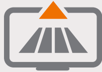
Ruckus Network Director™