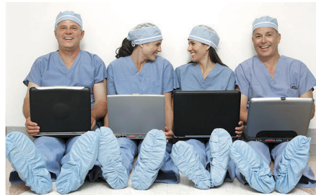
Sea Mar Community Health Centers is a non-profit corporation operating 45 clinics throughout the Pacific Northwest. Reliable Wi-Fi was an essential element to their day-to-day practice, if only they could find it. They did.

Sea Mar doctors, nurses and administrative staff were having intermittent problems staying connected to its legacy Siemens wireless network. This was costing Sea Mar time and money in delivering a wide range of health care services. Dropped connections and connectivity problems as staff moved around was forcing the manual input of important patient information into its electronic medical records system. This hampered productivity and resulted in fewer patient calls and lost revenue. For a non-profit organization, this could spell disaster.